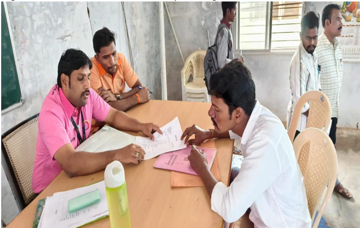
Amara Raja company