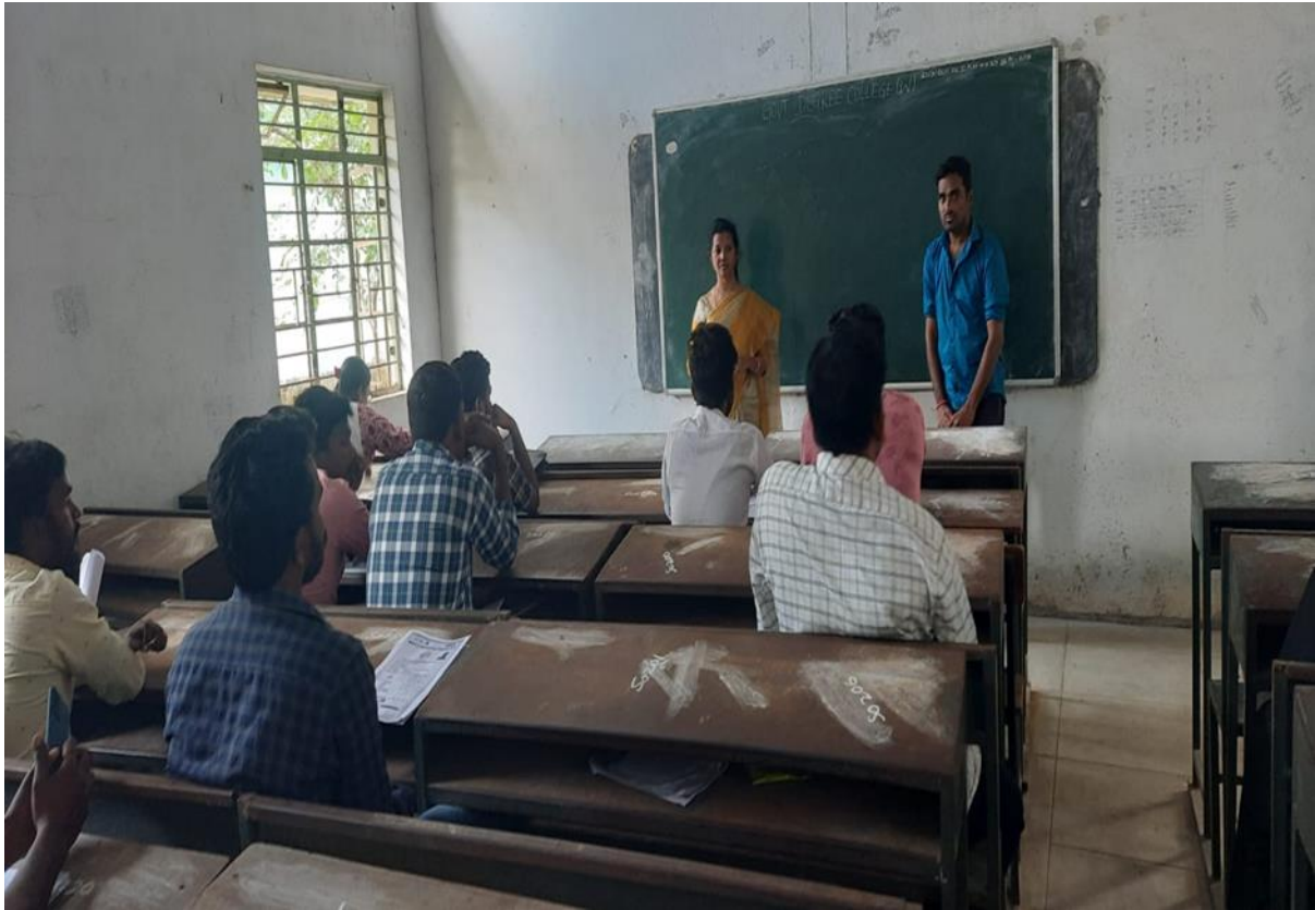
Apache India Pvt Limited, Telephonic interviews